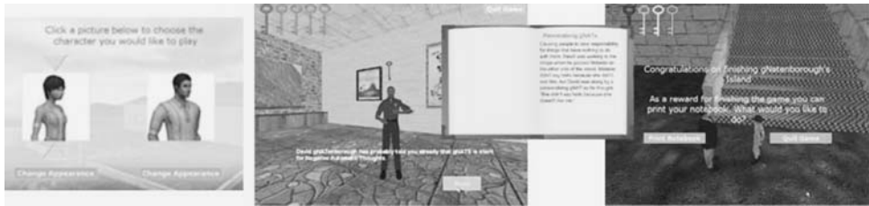
Figure 1. Screenshots of Personal Investigator.

PI was designed by a multi-disciplinary team, involving both technical and mental health care professionals. A critical factor in the design was to ensure that the game would not distract from the therapeutic process. While adolescents can find computer games engaging, there was little point in developing a game which, while deeply engaging for the adolescent, does little to assist in achieving therapeutic objectives, such as engagement with the therapist and with the therapeutic process. To be successful, the aim was to achieve a balance, whereby an appropriate level of engagement with the game enhances the client's engagement with the overall therapeutic process.